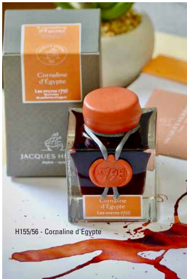
H155/56 - Cornaline d'Egypte