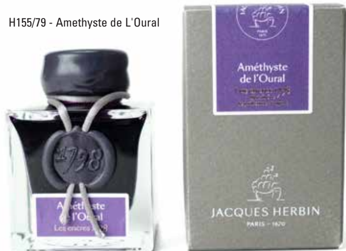
H155/79 - Amethyste de L'Oural